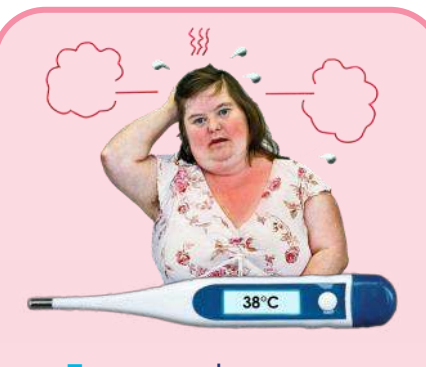
Fever where you have a temperature and feel hot

If you have any of these stay home and call a family member, friend, or support worker.