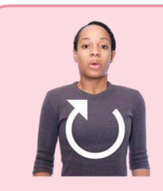
Trouble with your breathing